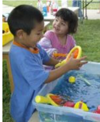
A preschooler enjoys the water table.