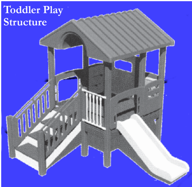
Toddler Play Structure

The Toddler Play Structure features stairs and a small slide as part of a house-like structure. A Toddler Bridge will be near by to allow toddlers to master the skill of climbing a small incline, and then stairs. Children 18 months to 3 years have been observed actively enjoying this type of structure. In addition to the development of motor skills, the house-like structure encourages imaginative play.